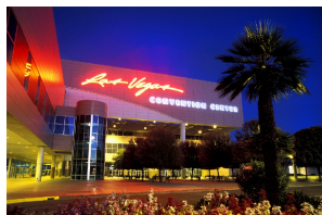
Las Vegas Convention center

NAB 2015 is a great opportunity to look at the latest innovative and advanced broadcast cloud software solutions developed by Etere for broadcasters and media companies. Attendees can discover a wide range of technology software with ERP design to improve the efficiency of their workflows while cutting costs.