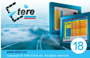
Etere SRL 18