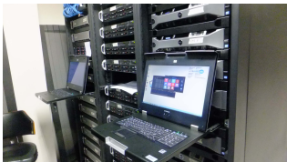
Metro TV Servers

ETERE is pleased to announce that the Indonesia's leading news television channel, Metro TV, has recently signed a contract with ETERE to implement a MERP Cloud system able to fully manage its newsroom operations as well as the media capture, asset management and playout automation of its three new digital channels.