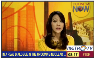
Metro TV - Indonesia Now

Metro TV, the Indonesia's first all-news channel, upgrades its newsroom with Etere and move to ETERE MAM in a complete MERP cloud system.