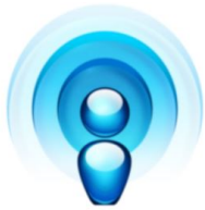
NUNZIO software logo

Etere plug-in for Adobe® Premiere gives Newsroom editors the possibility to quickly push their edited content into rundowns without exiting the Adobe environment!