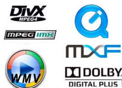
Supported formats Include

ETERE, the worldwide leader in software solutions for broadcast and media companies, today announced a new Quality Control (QC) solution for file-based workflows, a fully automatic content analysis and verification system able to meet all QC needs required in production, post-production, broadcast and distribution environments.