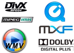
Supported formats Include

ETERE, the worldwide leader in software solutions for broadcast and media companies, today announced a new Quality Control (QC) solution for file-based workflows, a fully automatic content analysis and verification system able to meet all QC needs required in production, post-production, broadcast and distribution environments.