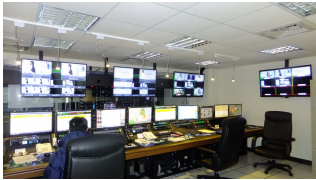
U-Life master control room

At present, ETERE helps its Taiwanese partner to manage the playout of its five cable channels; now, U-Life is planning to expand storage system through the addition of two Harmonic Mediadeck video servers. Etere is providing another convenient, cost-efficient, and uncompromising solution for bringing the U-Life channels to air, being worth mentioning that this Expansion is based on the up-to-date ETERE 23 and a streamlined MERP design.