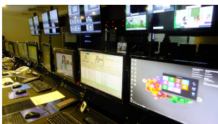
U-Life master control room